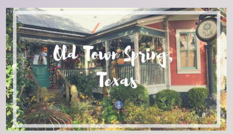
Old Town Spring